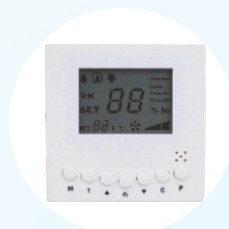
Optional Remote Control