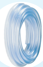
Wrinkle free tube