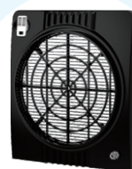
Optional Return Duct Kit